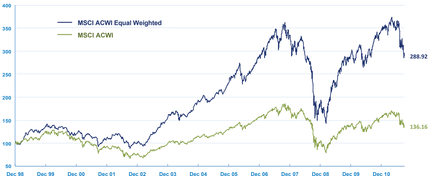
Index Performance—Total Returns (%) (September 30, 2011)