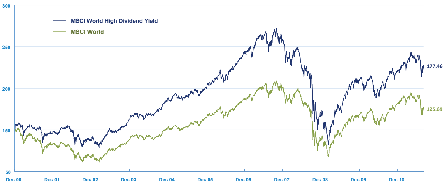
Index Performance—Total Returns (%) (Dec 31, 2000 – Aug 31, 2011)