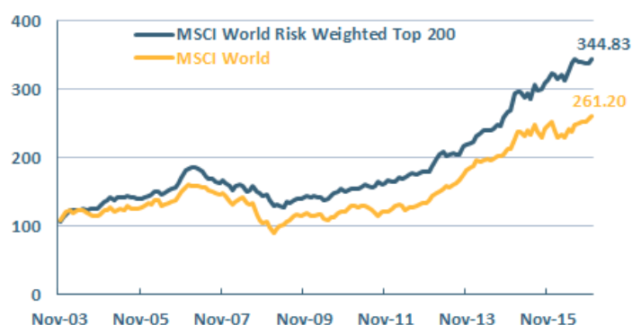
Performance Characteristics: Net Returns of the MSCI World Risk Weighted Top 200 and MSCI World Indexes (CAD)—(May 2003 – Dec 2016)