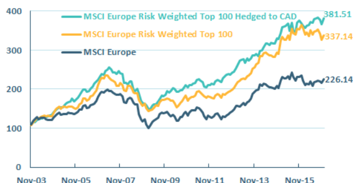
Net Returns of the MSCI Europe Risk Weighted Top 100, the MSCI Europe Risk Weighted Top 100 Hedged to CAD, and the MSCI Europe Indexes (CAD) (May 2003 – Dec 2016)