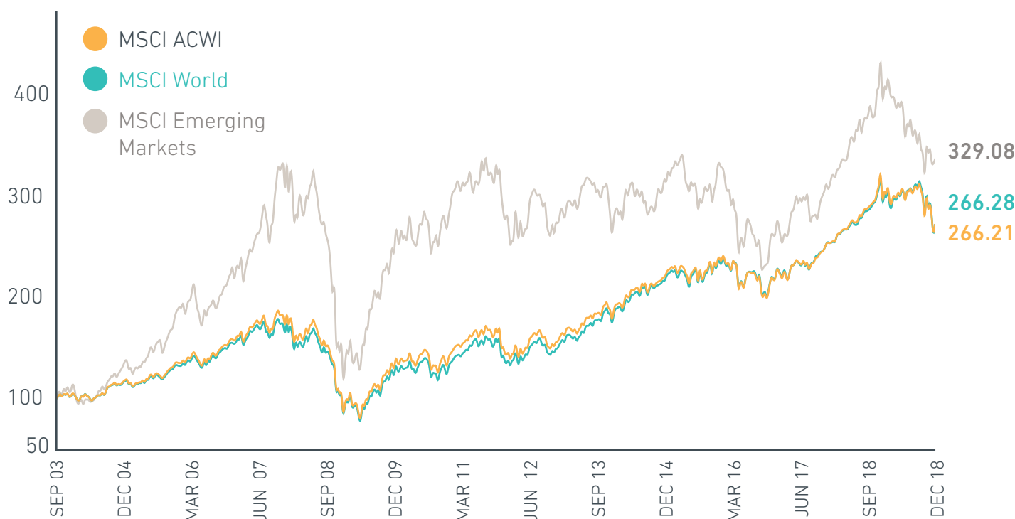
MSCI ACWI INDEX PERFORMANCE CHART 2 - GROSS RETURNS (USD)

The index is built using MSCI's Global Investable Market Index (GIMI) methodology, which is designed to take into account variations reflecting conditions across regions, market-cap sizes, sectors, style segments and combinations.