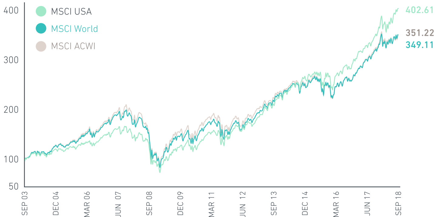
MSCI USA INDEX PERFORMANCE CHART 2 - GROSS RETURNS (USD)

The index is built using MSCI's Global Investable Market Index (GIMI) methodology, which is designed to take into account variations reflecting conditions across single countries, regions, market-cap segments, sectors and styles.