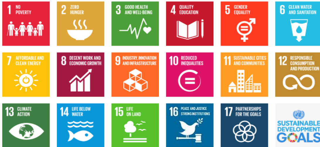
Exhibit 1: UN Sustainable Development Goals

The MSCI SDG Alignment methodology underpins MSCI Sustainability & Climate’s (MSCI S&C) 1 assessment of companies’ alignment with the 17 United Nations (UN) Sustainable Development Goals (SDGs). The SDGs were agreed to by 193 countries in 2015 with a target date for delivery of 2030. Based on the 2023 Agenda for Sustainable Development, the SDGs aim to foster collaboration within and between international private and public stakeholders to address critical global challenges such as poverty, inequality, climate change, environmental degradation, peace and justice.