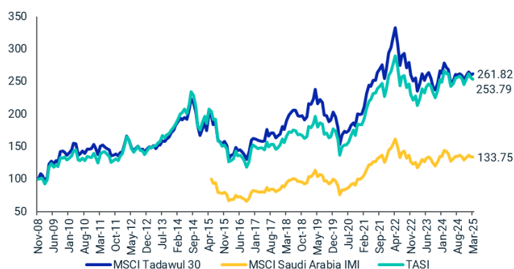
SAR Price Returns (%) (Nov 2008 – March 2025)