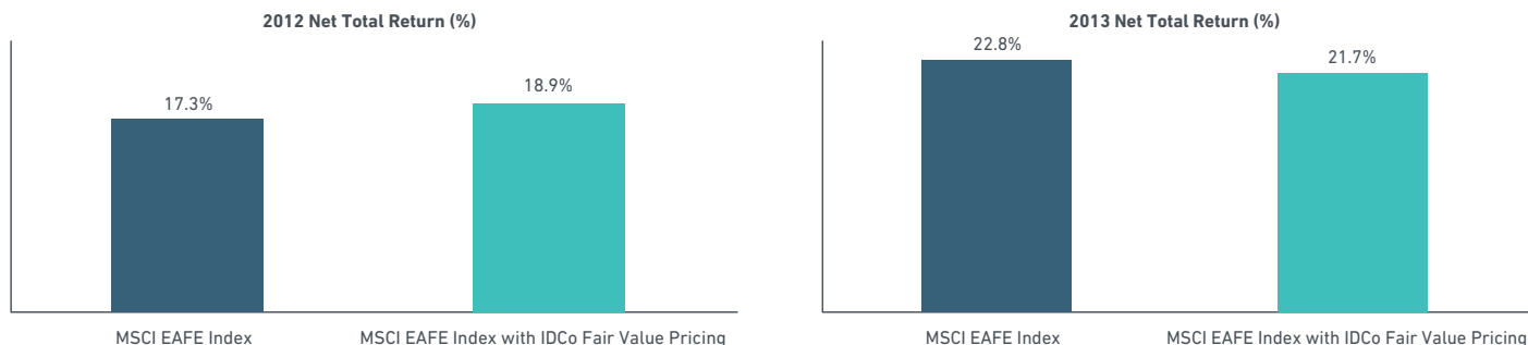
FIGURE 1: FAIR VALUE ADJUSTMENT COMPARISON