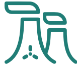
Pollution & Waste