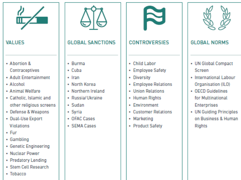
Figure 6 – MSCI ESG Screening Research

MSCI ESG Business Involvement Screening Research (BISR) aims to enable institutional investors to manage environmental, social and governance (ESG) standards and restrictions reliably and efficiently.