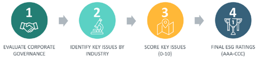
Figure 3 – MSCI ESG Rating Process