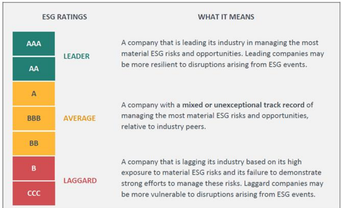
Figure 2 – MSCI ESG Ratings

A global team of 170+ research analysts rates over 6,400 companies (11,800 total issuers including subsidiaries) and more than 400,000 fixed income securities globally, including over 95% by market value of the Bloomberg Barclays Global Corporate Bond Index.