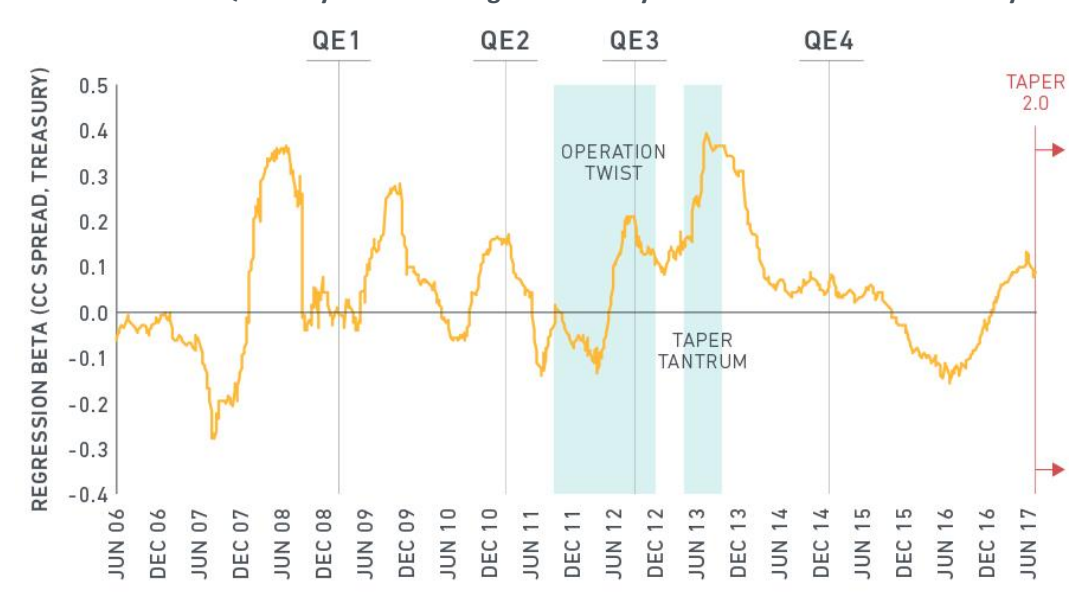
Exhibit 4: Lack of QE Clarity has Led to Higher Volatility and Positive OAS Directionality

Before the financial crisis, OAS directionality generally was negative. When interest rates fell and bond markets rallied, the MBS market generally became more wary of prepayment risk, often leading to widening of MBS spreads. As a result, the durations implied by market price dynamics were often shorter than OAS model durations.<sup>4</sup>