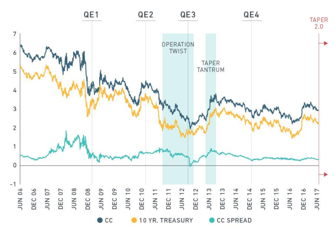
Exhibit 2: An Uneven Path: QE's Effect on Treasury and MBS Yields and Spreads

The QE programs fulfilled the Federal Reserve's aim of pushing down long-term bond and MBS yields after conventional monetary policy had cut short-term interest rates to zero. However, long-term bond yields did not always follow a smooth path, as we can see in Exhibit 2. For example, market speculation in the summer of 2013 that the Fed would taper its bond-buying program, and then again in the latter part of 2016 (combined with macroeconomic uncertainties), led to 100-150 basis point (bps) jumps in yields for short periods.